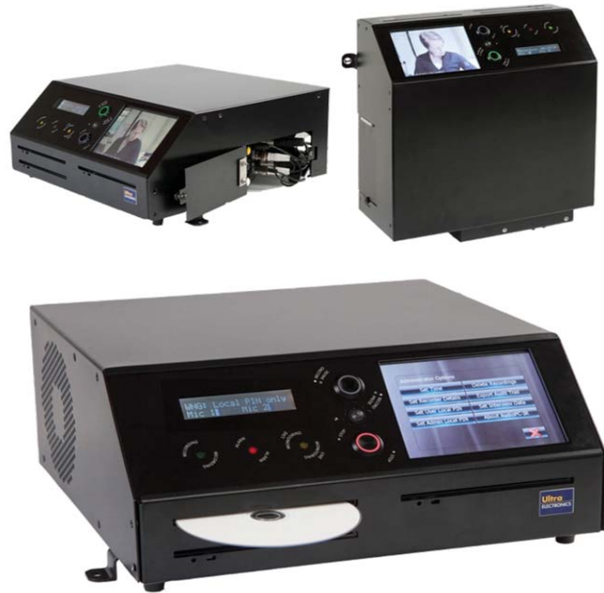
AudioPC-IR – self contained video recorder, robust and reliable, producing multiple DVD recordings simultaneously. Uses standard camera and microphone connections and may be desk or wall mounted.

Full training and ongoing support from our dedicated team of engineers provides peace of mind and our use of industry standard hardware readily supports evolving upgrades to our system in line with your changing business requirements.